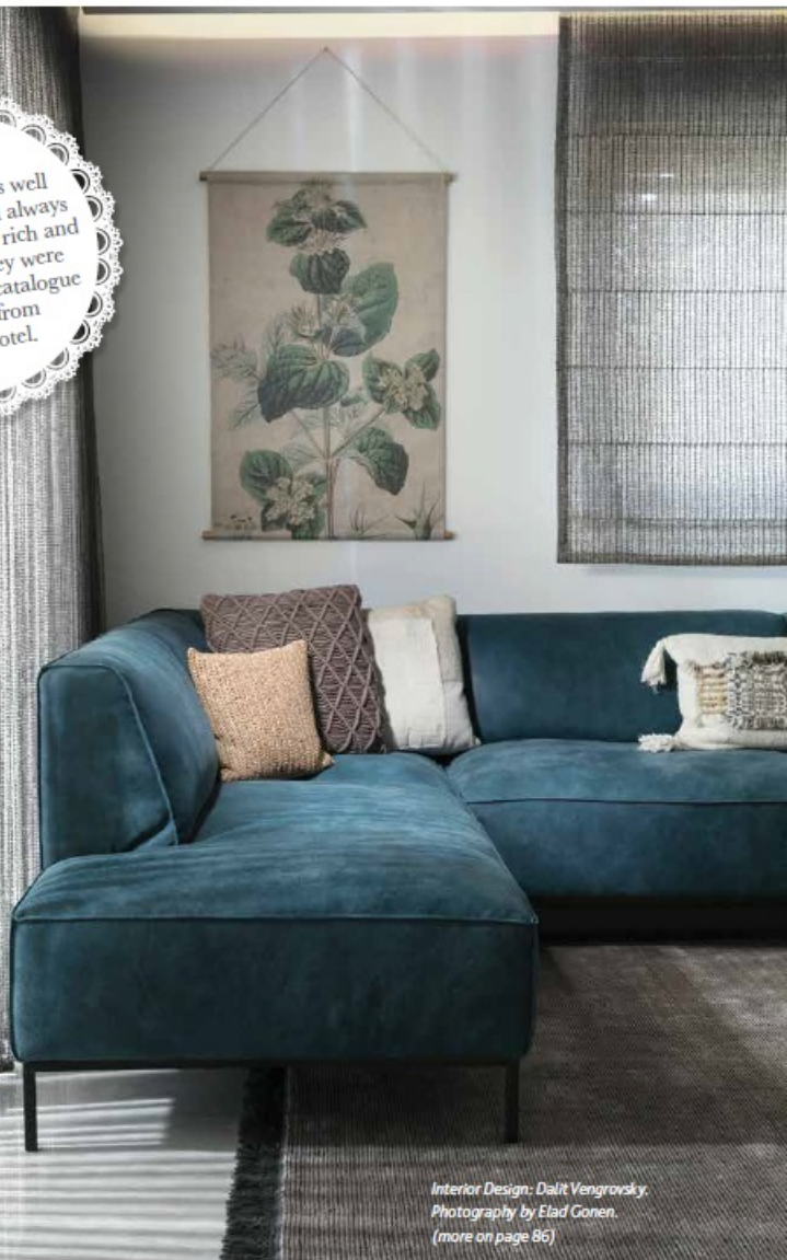
Interior Design: Dalit Vengrovsky. (more on page 86)

The furniture as well as the textiles will always look comfortable, rich and superb, as if they were picked out of a catalogue or straight from a luxury hotel.