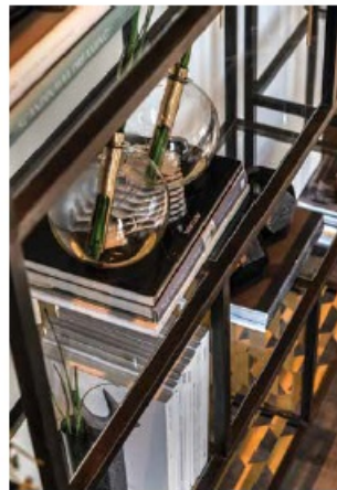
Interior Design: Aviram-Kushmirski Studio, Oshri Aviram and Dana Kushmirski. (more on page 79)

Always looking modern and too expensive to obtain - that is the modern luxury style full of modern chic. This style gives the feeling that every corner is treated to the smallest detail, and no wall is orphaned. The carpentry extends over entire walls, to their precise measurements. They may have secret doors, leading to back spaces not noted at first. The kitchen and bathroom tiles are superb, from marble, concrete or their artificial versions, and also extend massively over entire walls and surfaces, often encompassing a space from floor to ceiling. The ceiling is lowered by rational treatment, and contains recessed or concealed lighting fixtures. The furniture as well as the textiles will always look comfortable, rich and superb, as if they were picked out of a catalogue or straight from a luxury hotel.